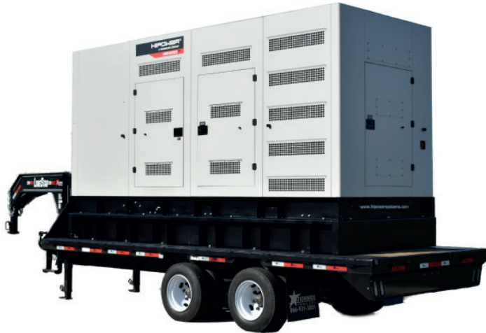
* Trailer is sold as option