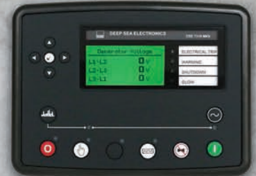
1 | DSEgenset® Digital Control Panel Model 7310 MKII