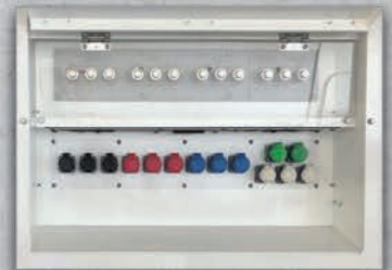
3 | Three-Phase Output Panel Optional Triple Row Cam-Locks™ Shown