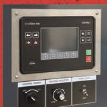
Parallelling Control Panel