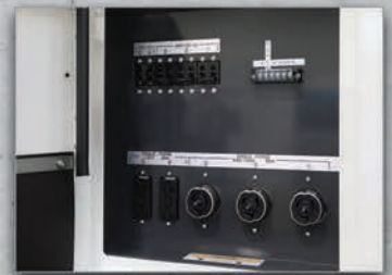
2 | Single-Phase Receptacles 120V - 20A x 2 | 240V - 50A x 3