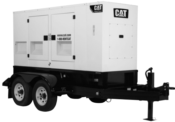
Picture shown with optional trailer