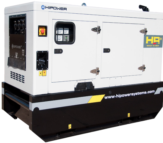
Photo depicts a typical Yanmar model but may not include options such as trailer.